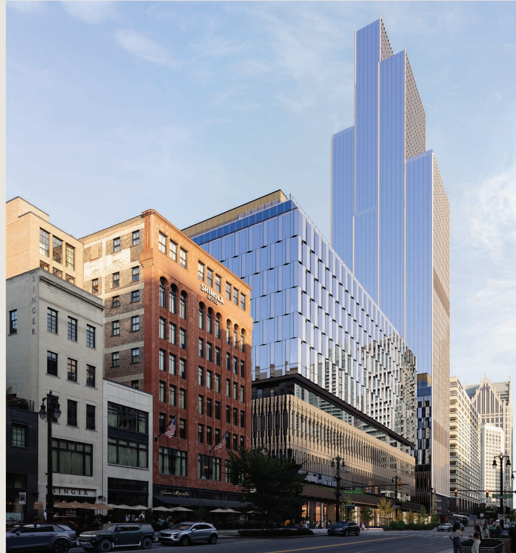
THE DEPARTMENT AT HUDSON'S